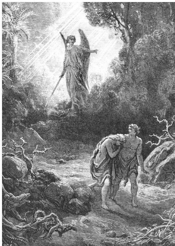
The Expulsion from the Garden, by Gustave Doré, 1855-1885

"In their pride and lack of trust, Adam and Eve disobeyed God's command."