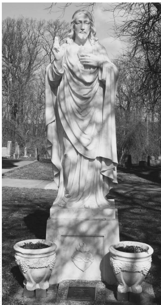
The Sacred Heart of Jesus, full of endless mercy

"The Lord's desire to save us is so strong that it extends even past the grave."