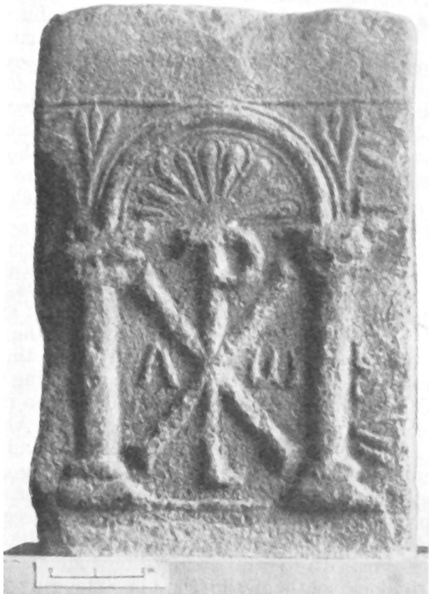
Chi-Rho symbol, formed from the first two letters from the word 'Christ' in the Greek language, 4th century Spanish tombstone

(CCC 102, 105-106, 109-111, 120, 128-129)