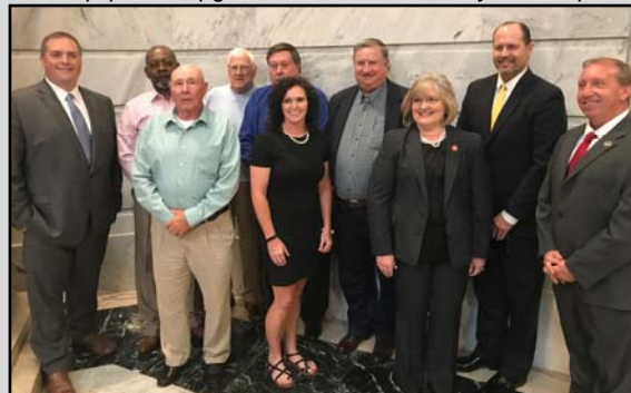
City of Crofton CDBG - Water Tank