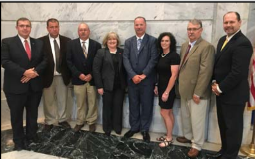
City of Cadiz CDBG - Water Treatment Plant

*Not pictured - City of Madisonville LWCF - City Park Improvements