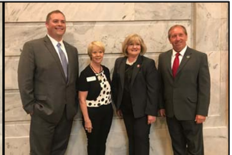
City of Pembroke LWCF City Park Improvements