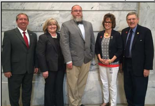
City of White Plains LWCF City Park Basketball Court Improvements