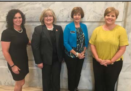
City of Elkton LWCF City Park Playground Equipment Upgrades