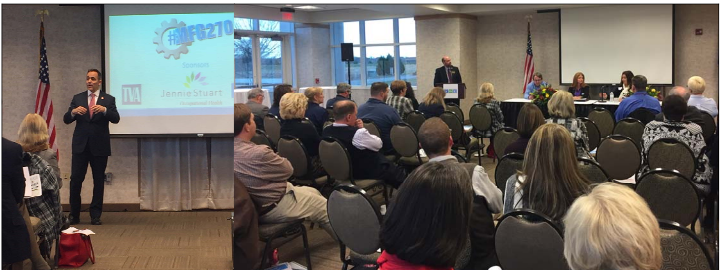
Kentucky Governor Matt Bevin

The South Western Kentucky Economic Development Corporation held the inaugural #MFG270 Workforce Development Summit on Wednesday, January 25. Special guest, Governor Matt Bevin, welcomed the crowd and provided some remarks on workforce initiatives that were underway statewide. Approximately 75 attendees heard from speakers that covered topics including employee retention, hiring military personnel and veterans, the rise of temporary employment since the 2008 Recession, and creating a talent supply chain. Panelists also presented the audience with a variety of workforce development resources that were available in the region through the Kentucky Workforce and Education Cabinet, the Christian County Chamber of Commerce, Hopkinsville Community College, and the West Kentucky Workforce Board.