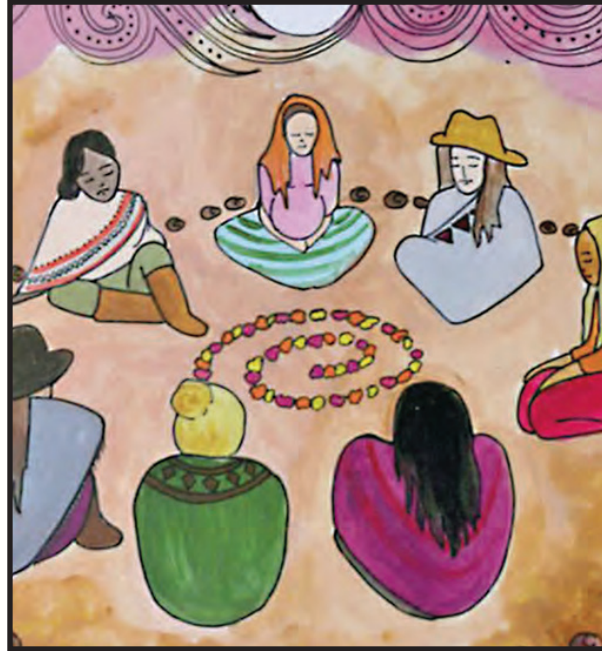
Sisterhood**, Catie Atison