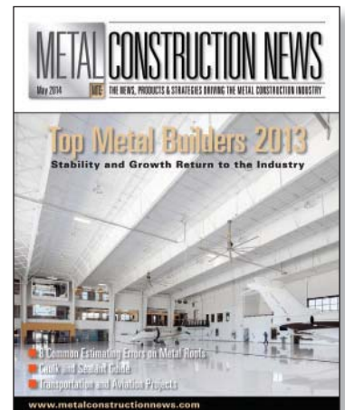
A corporate hangar facility at Fort Collins-Loveland Municipal Airport is clad with Magna-Loc standing seam roof panels, TLC-1 soffit panels and customized TL-17 panels from Metal. Sales Manufacturing Corp., Louisville, Ky.