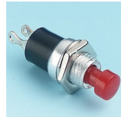
Switch - Allows electricity to pass through when depressed.