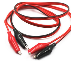
Wires - Conductors of electricity with an insulation surrounding them.