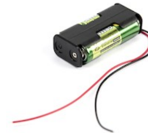
Battery - The cell within a holder.