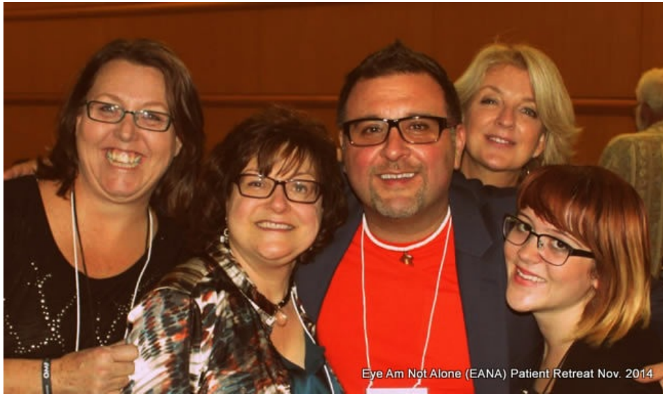
Eye Am Not Alone (EANA) Patient Retreat Nov. 2014